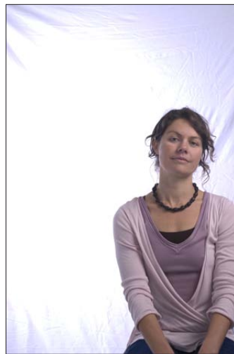
above and right: before and after

Processing defines the look and feel of the photo; it can enhance an existing characteristic of a scene, to help capture a mood that is often missing in a photograph. In the digital age this is what separates photographers: to a large extent it IS photography - taking the photos is just the first step of the process. This is why we don't like handing over the digital negatives without any processing.