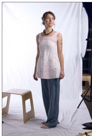
above and right: adding a digital backdrop