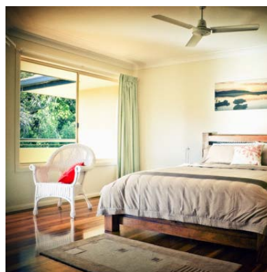
Light and Moody - contrast is tweaked, grain added, the highlights are made to glow slightly, plus a very subtle colour cast added to the shadows.