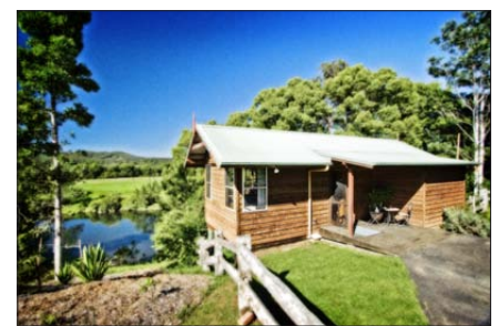
Light and Airy (used especially on shoots that focus on interiors and for accommodation providers)