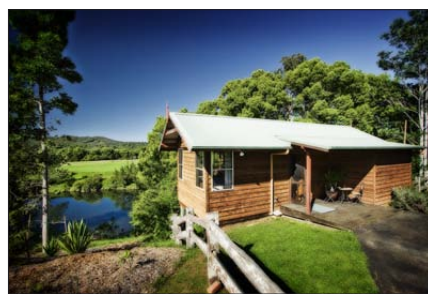
Dark and Moody.