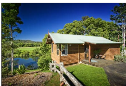
Crisp and Clear