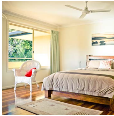
Minimal processing (these shots have been straightened, colour and contrast tweaked).