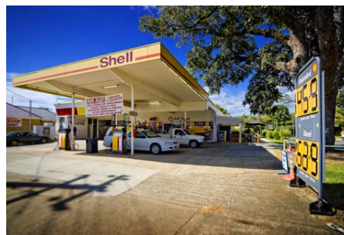
Minimal Processing (well in fact with this style there is often quite a lot of processing, but the aim is to make the photos look like they are totally "untweaked". In this case the shadows have been lightened selectively, contrast tweaked, sky adjusted, plus a little selective blurring.